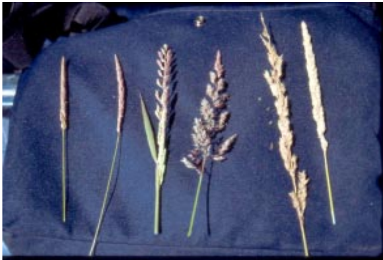
Photograph 5. Inflorescences at various stages.