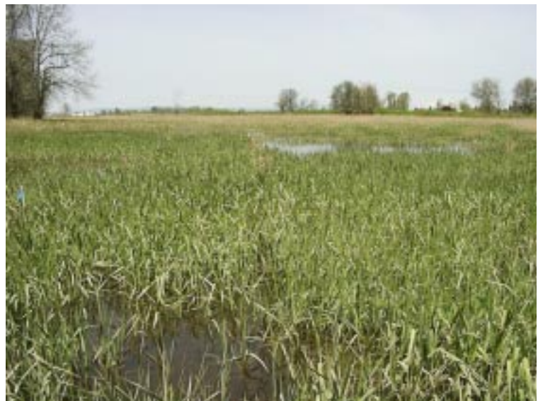
Photograph 2. Dense infestations can exclude all other plants.