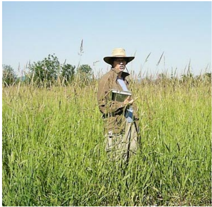
Photograph 3. Upright stems grow 2 meters tall.

RCG is native to Eurasia. There is some debate as to whether RCG is truly native to the greater interior mountain west and the Pacific Northwest region. A study by Merigliano & Lesica (1998) determined from herbarium specimens collected prior to 1900, that RCG was indeed native to some river systems in Montana, Idaho, and Wyoming. Due to its agronomic potential,