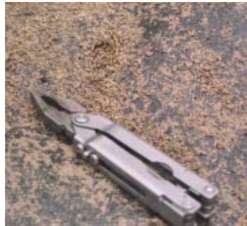
Photograph 7. Each inflorescence can produce up to 600 seeds.

There are a variety of methods available for the control of RCG. Which method or combination of methods you choose will depend ultimately on your management goals and objectives (are you trying to fully restore a Puget Sound wetland or just add structural diversity to a Willamette Valley riverbank?). Also, how many resources you are willing to invest and for how long, what resources do you already have available, and the size, distribution, and location of your RCG infestation will all determine which option you should choose to manage RCG. Unless you only have a few small isolated patches, the long-term successful management and control of RCG will require a multi-year commitment.