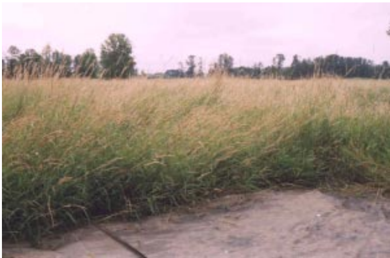
Photograph 8. Shade cloth provides specific, targeted control.

Solarization (essentially baking under clear or black plastic) or the use of a thick woven geotextile shade cloth can be used to eliminate RCG. In dense areas of patchy RCG growth this method can provide specific, targeted control (photograph 8). In areas where RCG is mixed-in with desirable species, the kill of those desirable species may or may not be an option. Also, the use of certain materials for this method depends on your overall management goals. There are reports from the Puget Sound region of good RCG control by using several layers of cardboard covered by 4 to 6 inches of wood mulch.