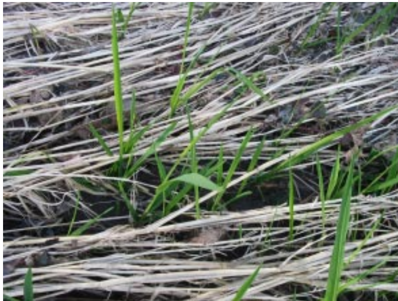
Photograph 6. New growth from rhizomes. Note the dense thatch from previous year.

Most plants and recurring populations of RCG are likely from rhizomes (photograph 6).