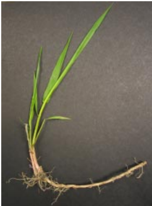
Photograph 1. Individual stem with rhizome

Reed canarygrass ( Phalaris arundinacea - RCG) is a perennial, cool-season, rhizomatous plant in the grass family (Poaceae / Gramineae) (photograph 1). Its creeping rhizomes often form a thick sod layer, which can exclude all other plants (photograph 2). Its upright stems grow to 2 meters tall from the rhizomes, and its flat leaf blades measure up to 0.5 m long by 2 cm wide (photograph 3). RCG has open sheaths, hollow stems, small clasping auricles and membranous ligules (photograph 4). Its